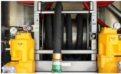
HIGH-FLOW HOSE REEL