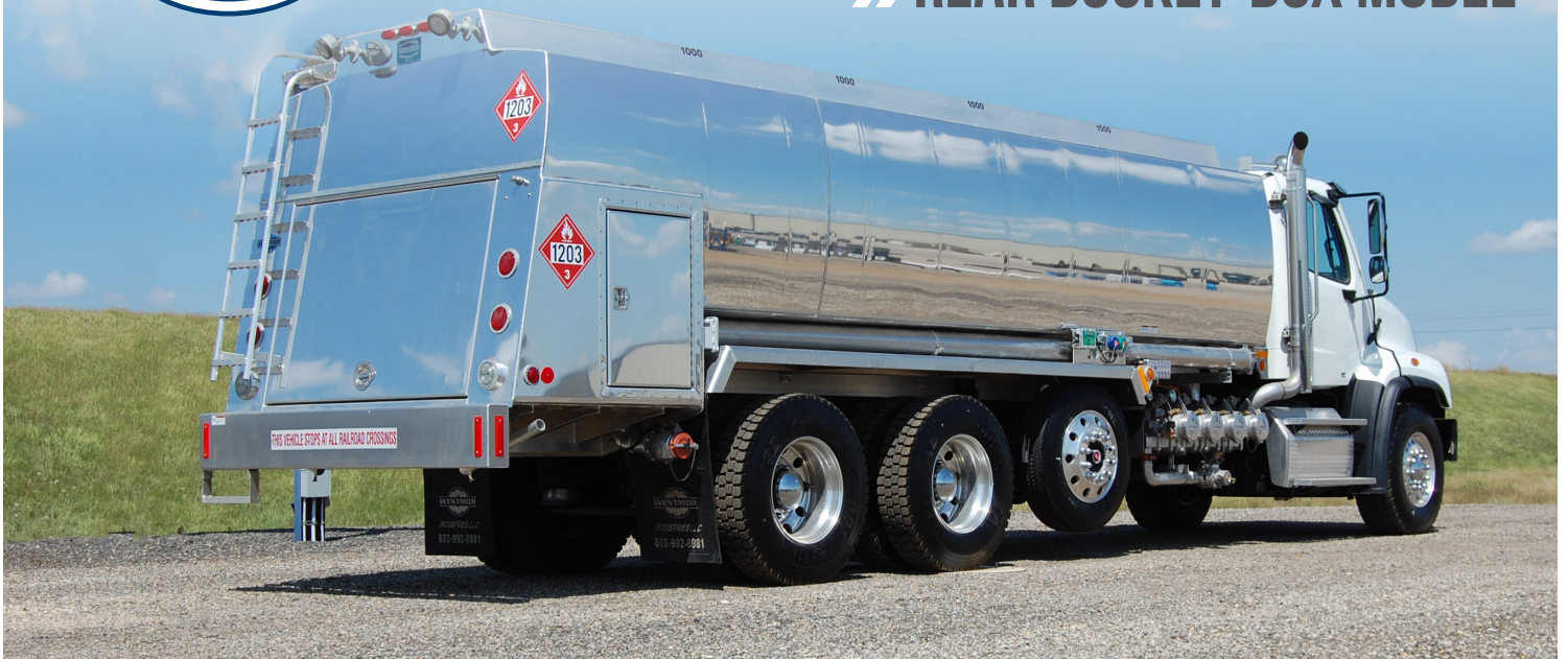
RBT REFINED FUEL TRUCK