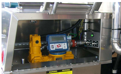
FRAME RAIL METER PAN