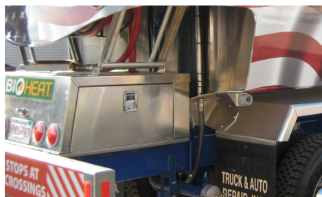
WATER TIGHT METER COVER DOOR