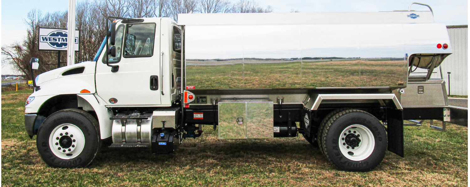
HCT REFINED FUEL TRUCK